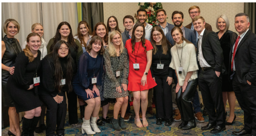
UAMS Medical Student attendees and their Sponsors from SVMIC