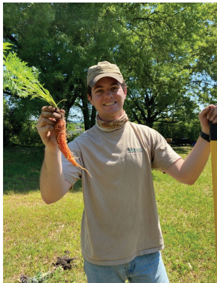
A carrot we found that had been growing all on its own