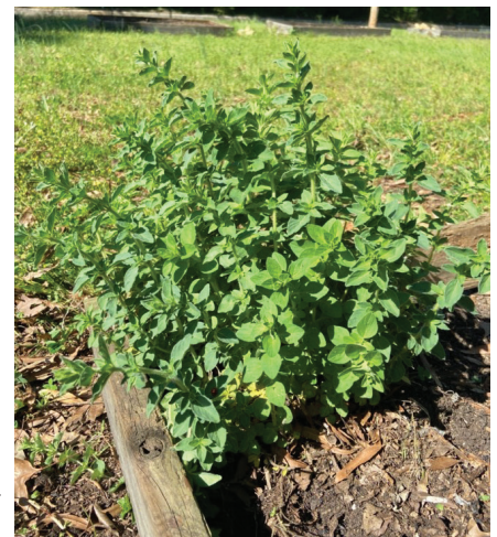
Oregano still growing from last year!