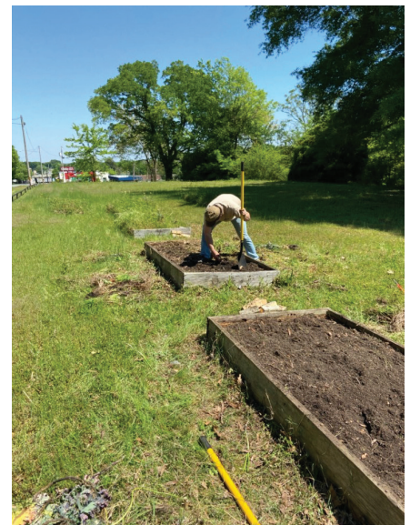
Two of the weeded beds and a few more in the background that still need work.

On Sunday, April 25, 2021 UAMS students began repairing and preparing the Harmony Health Clinic garden for planting this year. The pandemic did not allow much work on the garden in 2020, but 2021 is looking like it will be much better.